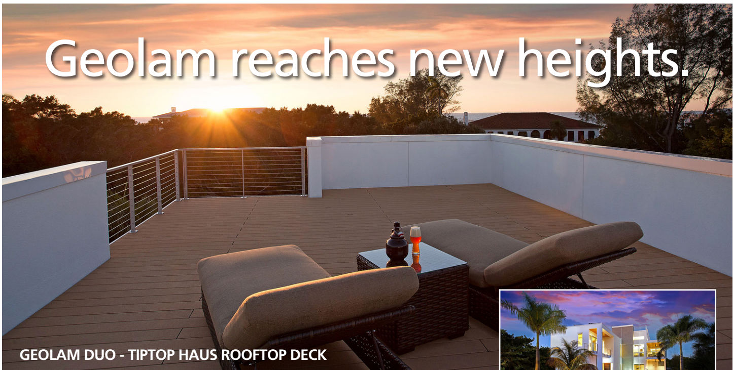
GEOLAM DUO - TIPTOP HAUS ROOFTOP DECK